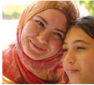
Recently naturalized U.S. citizens

HCC Life Short Term Medical (STM) provides affordable temporary health insurance to protect you and your family. You should consider purchasing HCC Life STM if you are concerned about protecting yourself from the potentially high medical costs associated with an unexpected sickness or injury.