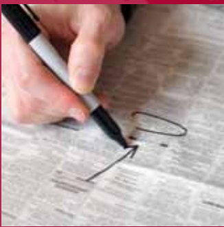
TRANSITIONING BETWEEN JOBS