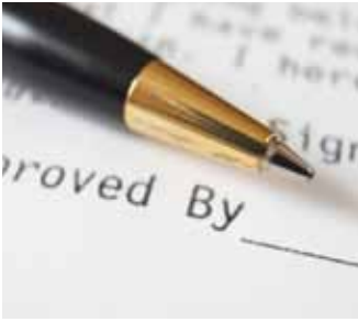
Waiting for major medical