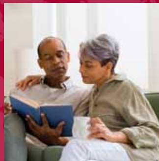
WAITING FOR MEDICARE COVERAGE