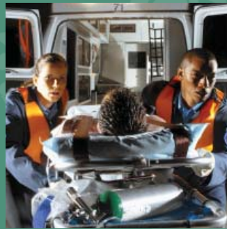
TRAVEL AND EMERGENCY MEDICAL ASSISTANCE