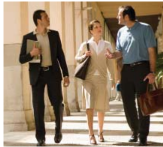
Rio de Janeiro, Brazil