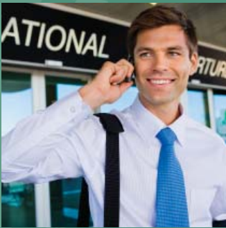
LAST MINUTE INTERNATIONAL TRIPS